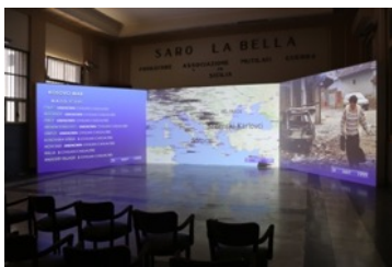
* From Manifesta 12 Casa del Mutilato, Palermo 2018

Worked as Chief Curator at Mercien Karuizawa Museum for 5 years. Dedicated to Musashino Art University as Professor for 12 years. Currently Artistic Director of the exhibitions of Maison de la Culture du Japon à Paris.