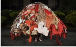
From “writtenafterwards” 2018 Spring/Summer Collection

“writtenafterwards” Fashion Show ※November 9 (Sat) 17:00~