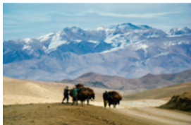
From “Silk Road” by Kishin Shinoyama

Special exhibition where the theme “FLOATING NOMAD” overlaps with the image of people on the trade route Kishin Shinoyama “Silk Road” Photo Exhibition