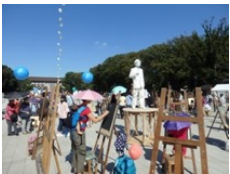
From the 2018 outdoor photo competition “Statue photo competition”

An upgraded version of last year's popular outdoor sketching event will be conducted “coconogacco” Outdoor Workshop